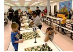
1 of 1 Click to enlarge