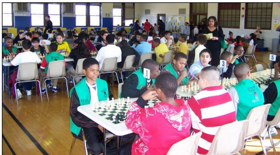
Chess Tournament at Henry Clay School

We organized and directed 21 chess tournaments that range from novice tournaments to the highly competitive Knights Quest series and included the Regional Playoffs and K-8 Championship tournaments for Chicago Public Schools. These competitive chess tournaments are held on the weekend or school holiday and draws between 70 and 450 players from kindergarten through high school. Renaissance Knights organizes and directs these exciting events ensuring that students are challenged and encouraged throughout the tournament.