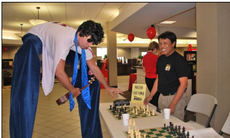
Six Corners Cornucopia