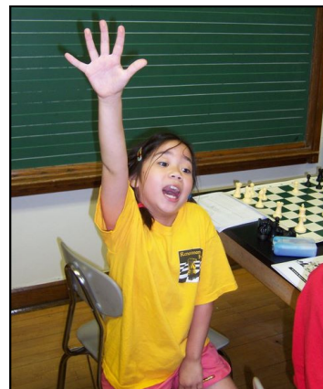
Canty Summer Camp