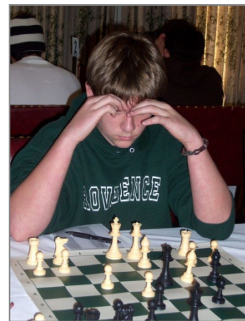
Every move counts

The greatest gift we can give our children is the ability to make good decisions