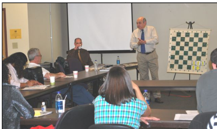
Teacher's Training Workshop