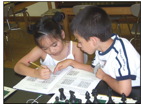
Working together to solve problems