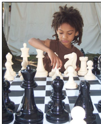
African Festival of the Arts