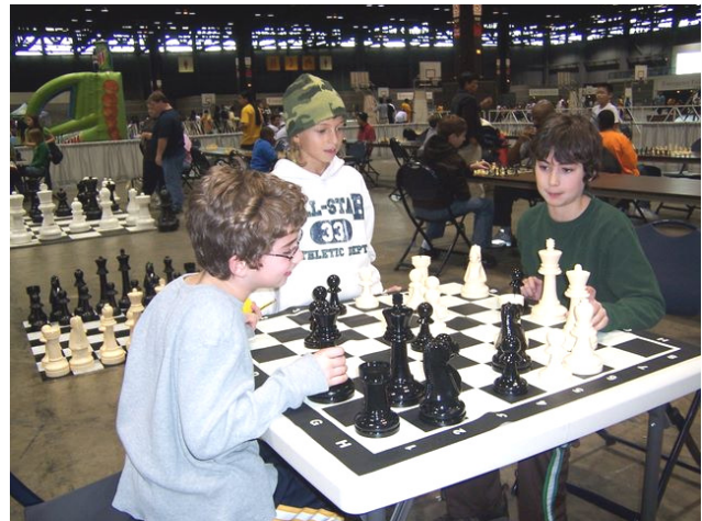
Mayor Daley's Holiday Sports Festival

The Community Chess Program focuses on promoting the academic and life skills gained through learning and playing chess by sponsoring chess at community events in Chicago. Renaissance Knights sponsored chess pavilions at The Taste of Chicago, Kennedy King College Back to School Festival, The African Festival of the Arts Festival, Mayor Daley's Holiday Sports Festival and the National Teen Test Day at the South Shore Cultural Center. Over 5000 children, adults and seniors participated in chess activities at these events.