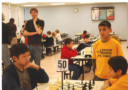
CPS K-8 Championship

We teach kids to strategically think about their future one move at a time