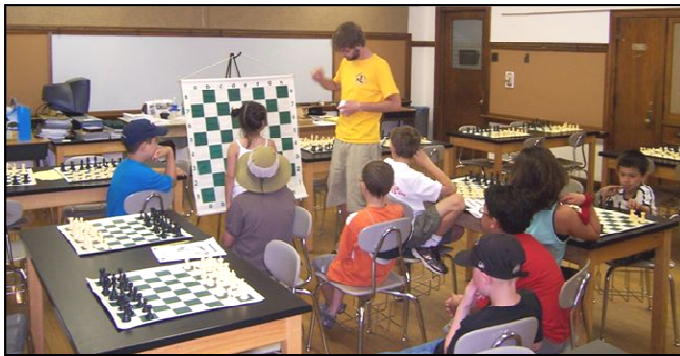
Summer Camp at Canty School

Through our summer programs we operated multi-day chess camps throughout the Chicagoland area during school breaks. Summer Camps offer students the opportunity to learn in-depth with other campers at the same level while having a fun time. In partnership with Chicago Public Schools camps were held at Coles, Canty and Stewart Schools. We also held camps at Wright College and at the beautiful Lake Zurich Chalet.